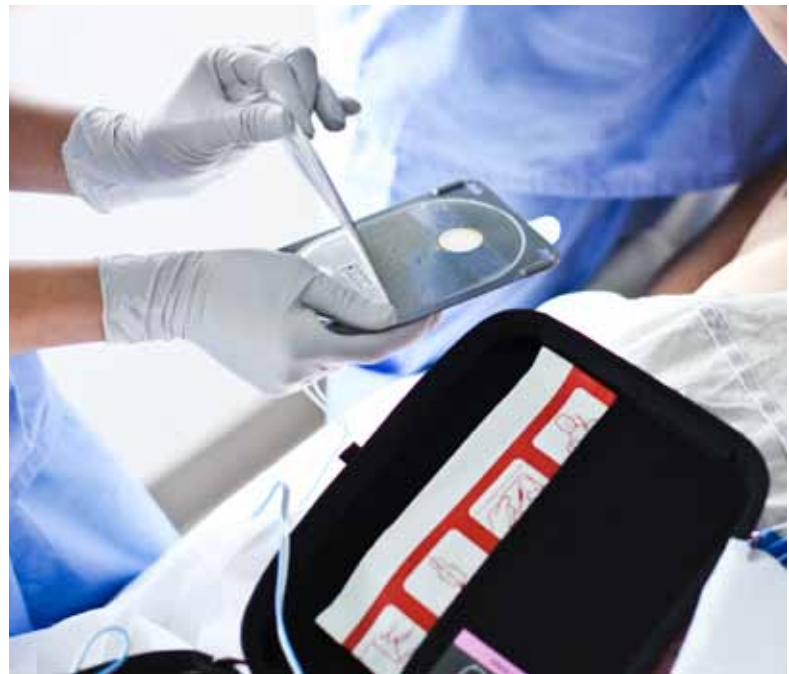
The HeartStart FR3 is the smallest and lightest professional-grade AED among the leading global manufacturers.